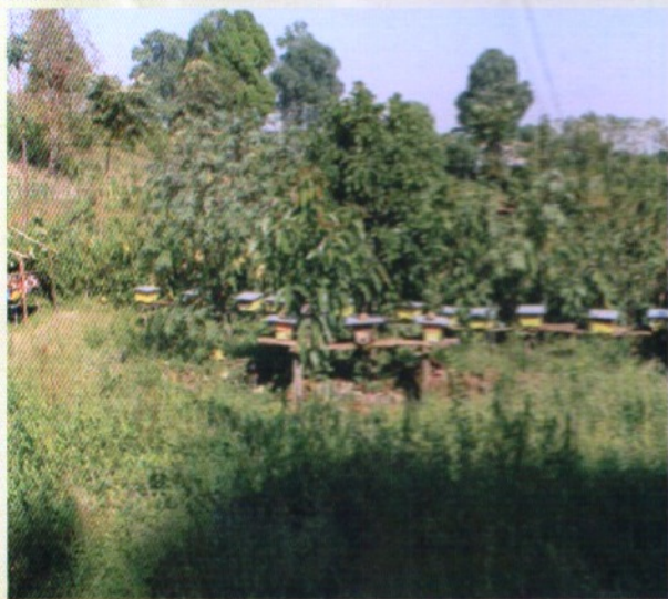
An apiary with intermediate and box hives in a home garden near Masha, SNNPR (2014)

To participate on the symposium and/or to be engaged in apiculture business in Ethiopia please contact us: