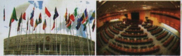
Figure 2: UNECA Conference Building and meeting room

the airport, the UNECA Conference Centre is located next to the historic Africa Hall and the offices of the UNECA and other UN specialized agencies. In the vicinity of the UNECA, a number of the city's best hotels, restaurants and shopping centres are found.